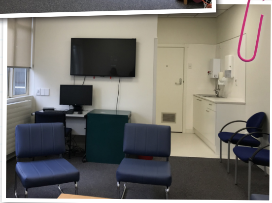
The new and improved Consult Liaison rooms.