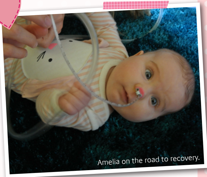
Amelia on the road to recovery.