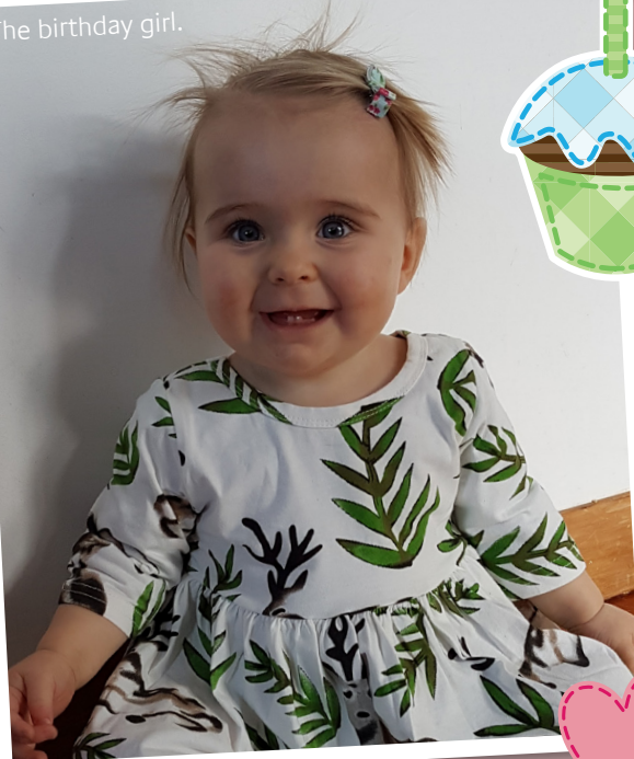
The birthday girl.