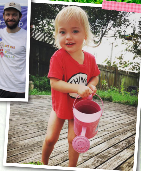
Olive thriving at home.