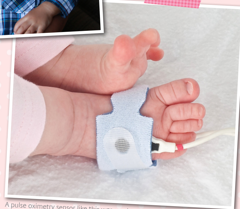
A pulse oximetry sensor like this was used to screen Tu'amelie.