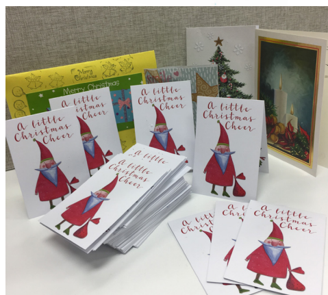
A small selection of the many wonderful cards and messages you sent in at Christmas